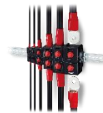
EF2 ZERO SCREW™

Small and High Current 1-6pos. 65A Max. (UL Standard) 1000V AC, 8-12 AWG