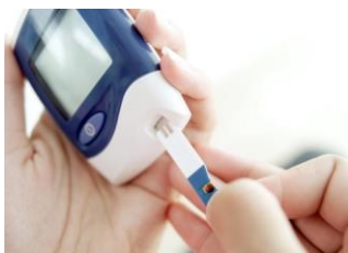
▲ Blood Glucose Meter and more...