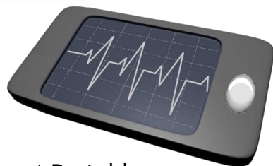
▲ Portable Electrocardiograph