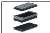
IT3 3 Piece BGA Connector 10+Gbps High Speed Mated Height: 17-42mm No. of Pos.: 100, 200, 300