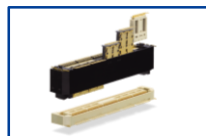
XG1 High Speed Coplanar Connector 16+Gbps High Speed Mated Height: 20-42mm No. of Pos.: 78-260