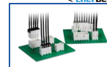
DF33C Pitch: 3.3mm No. of Pos.: 2-12 Rated Current: 5A Max.