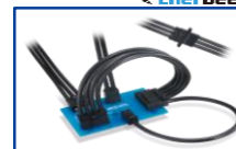
DF60 Pitch: 10.16mm No. of Pos.: 1-6 Rated Current: 65A Max.*