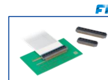
FH41 For Shielded FFC Pitch: 0.5mm No. of Pos.: 15-68