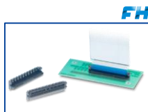
FH48 For Shielded FFC Vertical Pitch: 0.5mm No. of Pos.: 20-68