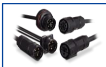
HR41 IP67, IP68 Interface Connector No. of Pos.: 3, 5 Rated Current: 20A Max.