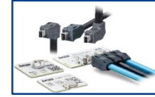
ix Industrial™ IEC Standard Cat.6A 10Gbps High Speed Rated Current : 1.5A (All Contacts) 3A (Contact No.1,2,6,7) Applicable Cable : 22-28 AWG