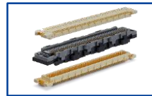
FX10 (Piece) 15Gbps High Speed Pitch: 0.5mm Mated Height: 8-13mm No. of Pos.: 80-168 Rated Current: 0.3A