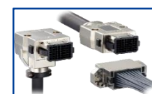
PQ50S Light Weight, Non-waterproof Type Rated Current: 12.5A Max. No. of Pos.: 48 Applicable Cable: 17-28 AWG