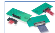
FX15 Wire-to-Board Pitch: 1.0mm Applicable Cable: 36~40 AWG (Thin Wire Coaxial Cable) 28~32 AWG (Discreet Cable) Rated Current: 0.5A No. of Pos: 21,31,41,51