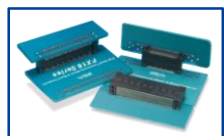
FX18 10+Gbps High Speed Pitch: 0.8mm No. of Pos.: 40-180 Rated Current: Signal: 0.5A Power: 3A