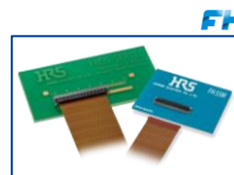
FH55/FH55M 10+Gbps High Speed For FPC Pitch: 0.5mm Mated Height: 1.5mm No. of Pos.: 10-40