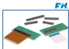
FH28K For FPC and FFC Robust Lock Design Pitch: 0.5mm No. of Pos.: 10-80