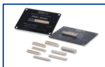
FX8/FX8C 3.125Gbps High Speed Coplanar Connector Pitch: 0.6mm No. of Pos.: 40-280 Rated Current: 0.4A