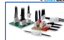
DF22 Pitch: 7.92mm No. of Pos.: 1-5 Rated Current: 30A Max.